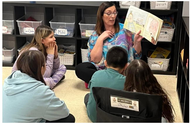
On World Read Aloud Day, NSD celebrated the power of storytelling and the joy of reading together! To mark the occasion, Learning Coaches launched a divisionwide challenge called "Build Your Story." Students were encouraged to reflect on their learning and create imaginative tales to share. Watch students reading their stories here: <u>https://tinyurl.com/yc3h2b4v</u>. NSD schools also hosted various activities to celebrate the day.

https://learn.birdbraintechnologies.com/finch1/curricul um/.