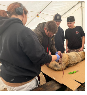
Bill Woodward School students in Anzac took part in a land camp, where they were introduced to trapping and traditional hide preparation. They had a hands-on experience skinning a coyote, scraping the hide, and preparing it for stretching gaining insight into skills used in the fur trade.