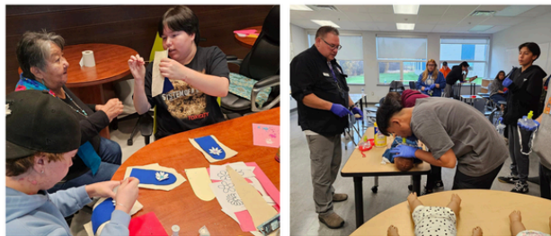
At Mistassiniy School, students had the chance to go camping, explore mechanics, create bleach-designed t-shirts, gain skills in safe food handling, cosmetology, and esthetics, make moccasins, receive first aid training, and learn about sports psychology.