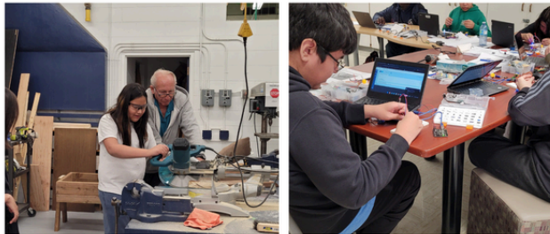
Grouard Northland School and Gift Lake School students explored carpentry and coding!

In October, NSD hosted Career and Technology Studies Days! High school students from across the school division had a fantastic time exploring hands-on learning opportunities while earning credits towards graduation.