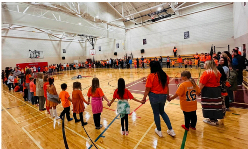
Anzac students and staff joined together in a round dance during Truth and Reconciliation Week.

https://www.nsd61.ca/about-us/division-news/post/truth-and-reconciliation-week-highlights2 .