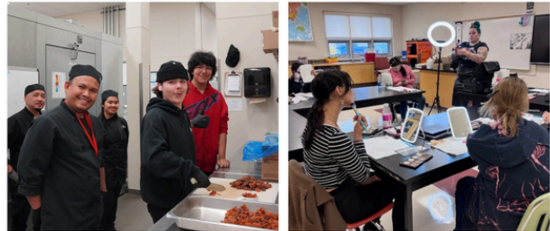
At Bill Woodward School, students gained valuable hands-on experience and explored various career paths through job shadowing and skill-building activities.

A huge thank you to all the companies and individuals who made this possible, including MacDonald Island Park, Brignall Equipment Solutions LTD, Royal LePage Benchmark, Head Case Artistry, Bazylo and Dunn Chartered Professional Accountants, as well as the dedicated staff at Anzac Community School and Bill Woodward School who welcomed students into teaching roles, custodial work, and personal fitness.