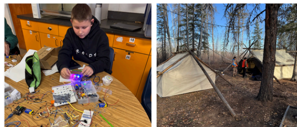
At Paddle Prairie School, students had the choice between coding, business, and an outdoor overnight cultural camp!

A huge thank you to all the companies and individuals who made this possible, including MacDonald Island Park, Brignall Equipment Solutions LTD, Royal LePage Benchmark, Head Case Artistry, Bazylo and Dunn Chartered Professional Accountants, as well as the dedicated staff at Anzac Community School and Bill Woodward School who welcomed students into teaching roles, custodial work, and personal fitness.