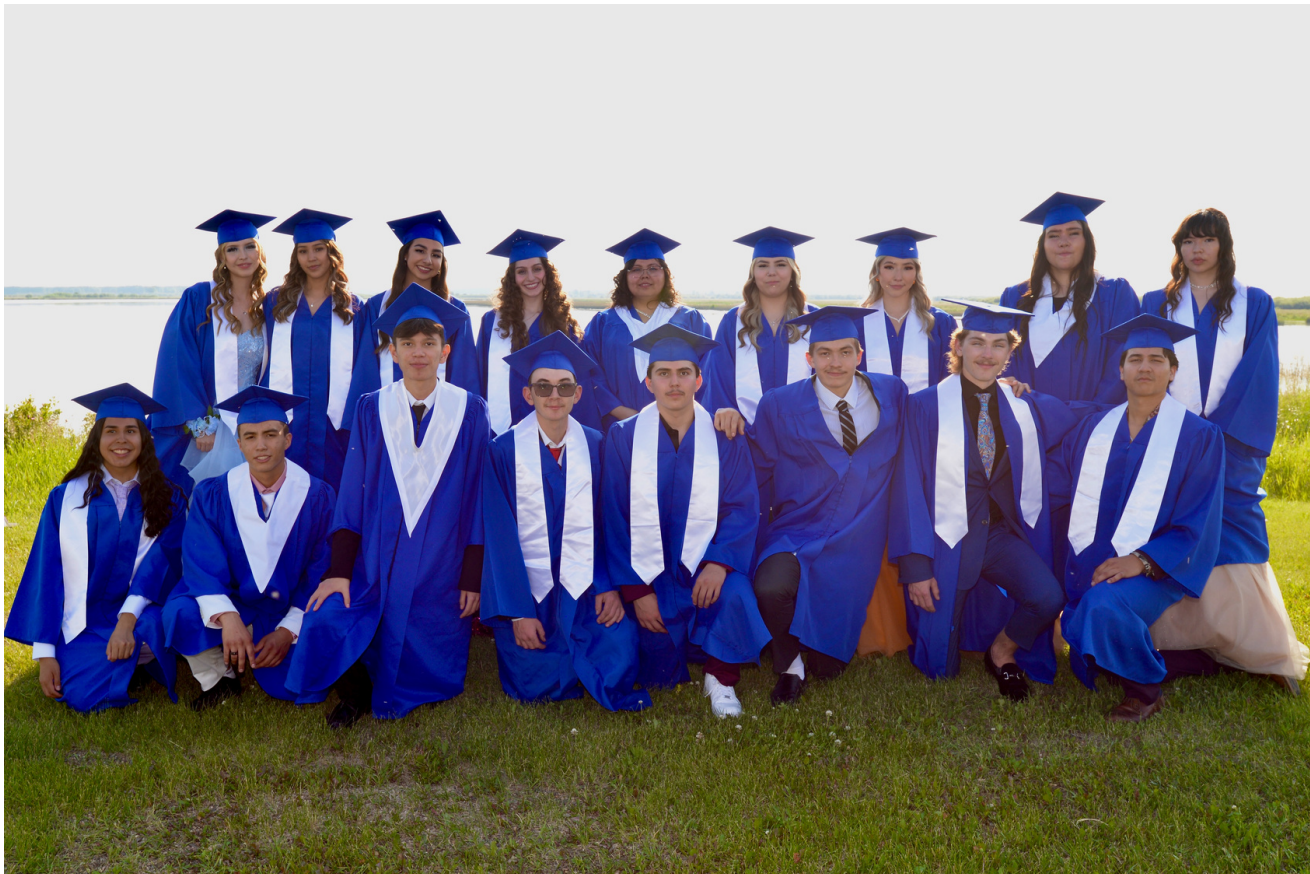
The Class of 2023 at Mistassiniy School in Wabasca-Desmarais!

How is Northland achieving these outcomes?