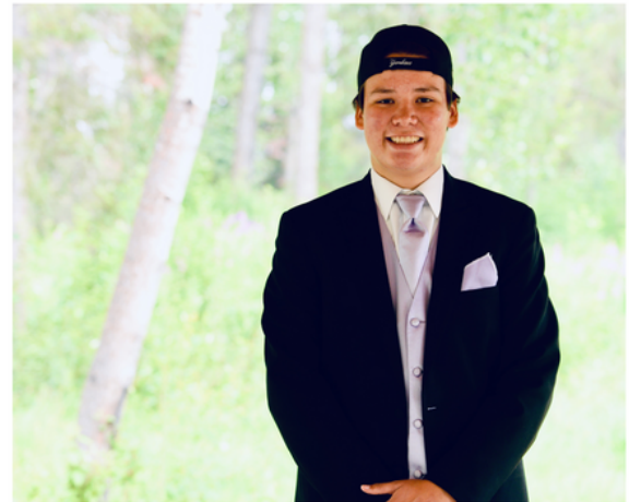
The Class of 2023 at Career Pathways School in Wabasca-Desmarais!