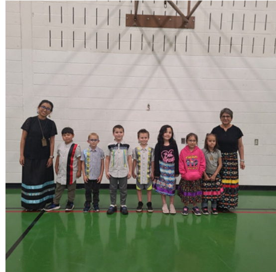
National Indigenous Peoples Day activities

The following are examples of how Northland recognized National Indigenous Peoples Day: