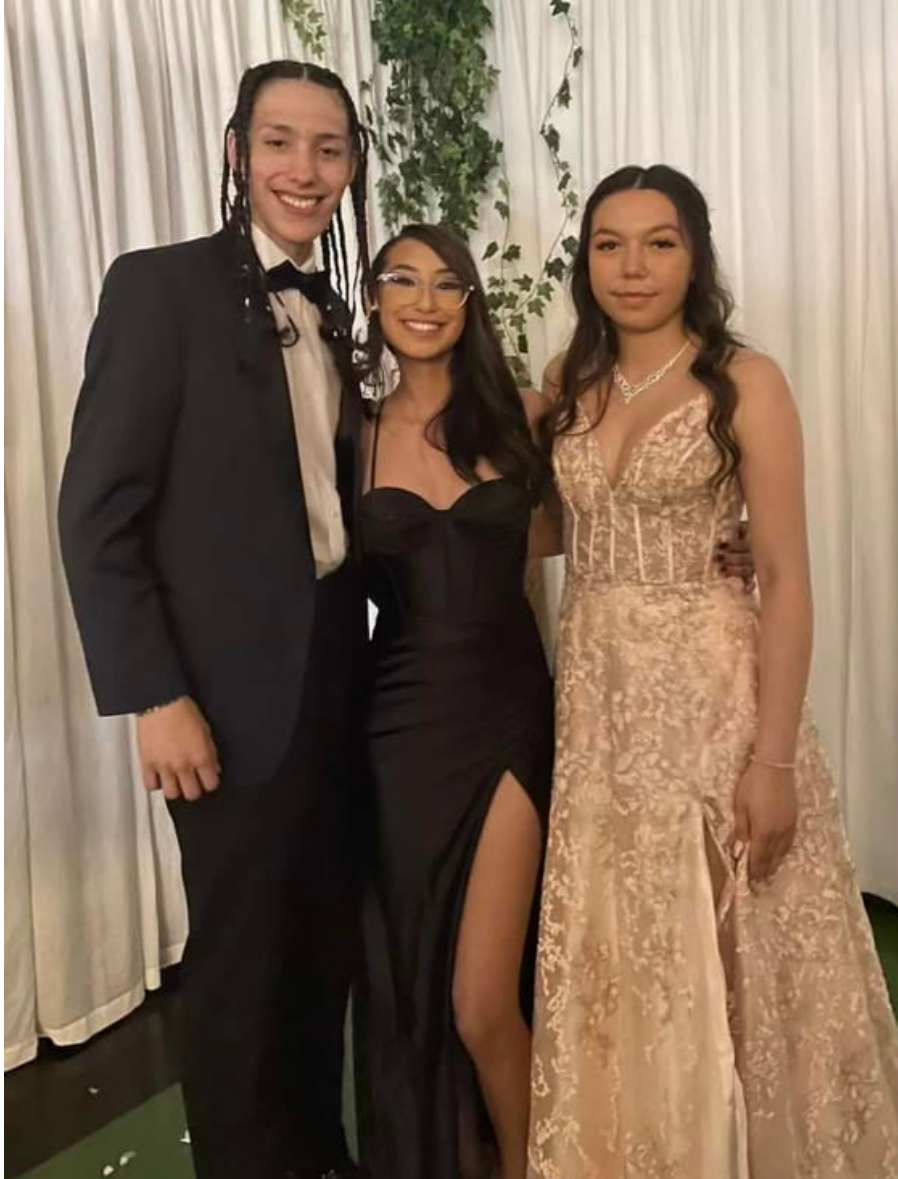
The Class of 2023 at Paddle Prairie School!