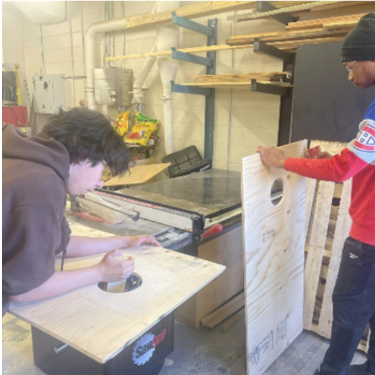
CTS Day activities at NSD schools

NSD hosted Career and Technology Studies (CTS) Days on April 13-14 and May 4-5. As you can see in the photos, grade 12 students from Bill Woodward School earned credits while taking construction and computer programming courses.