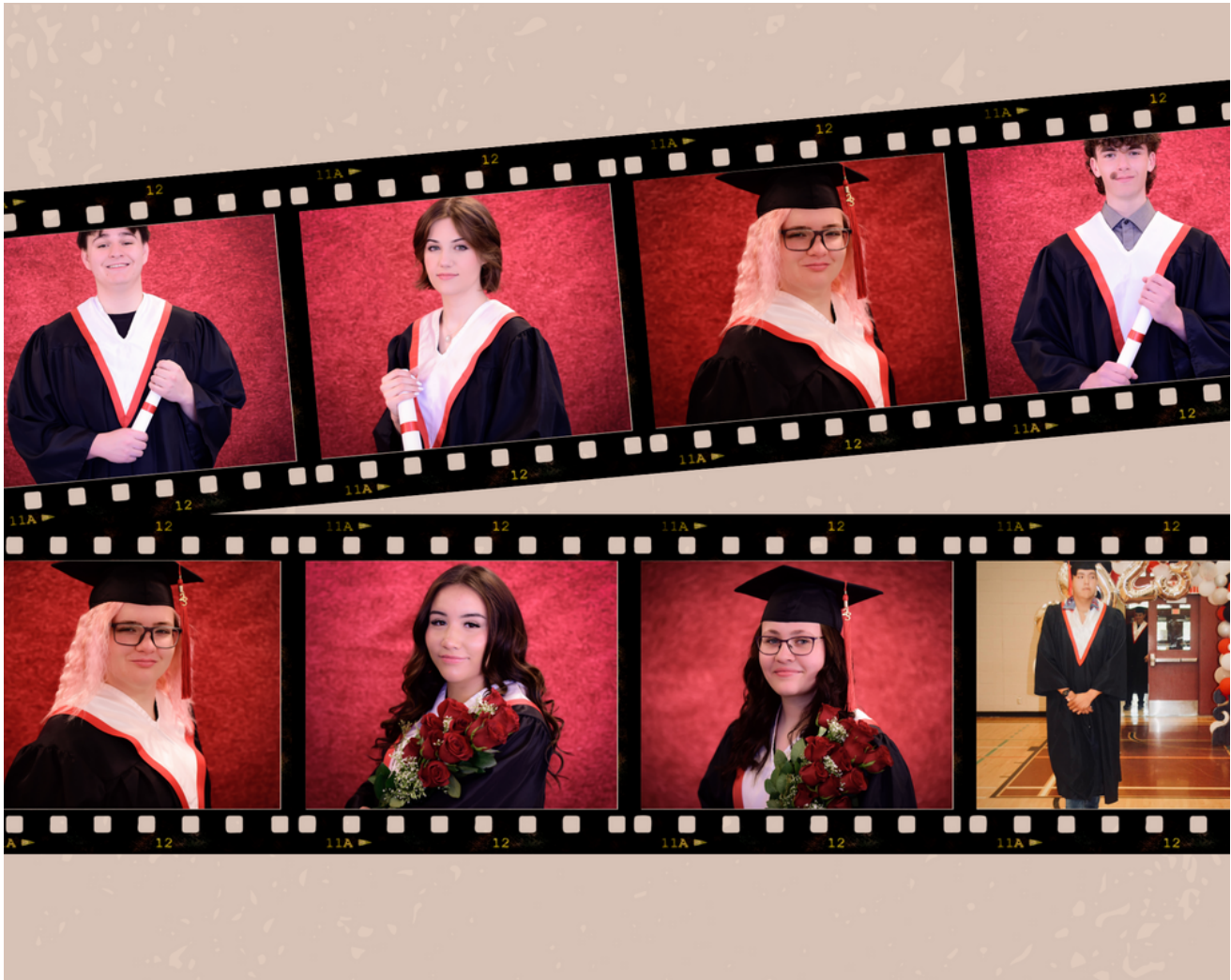
The Class of 2023 at Bill Woodward School in Anzac!