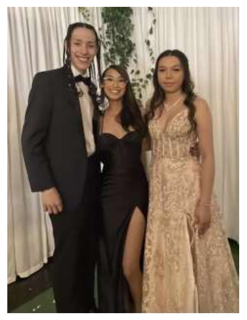
Class of 2023 at Paddle Prairie School!

The latest edition of the Acting Superintendent's Highlights features NSD graduates, learning options for high school students, new housing units for teachers, special messages from fire crews protecting the community of Chipewyan Lake and National Indigenous Peoples Day events.